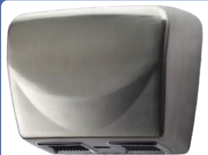
AS 25-IR SB (S.S. # 304 brush finish)