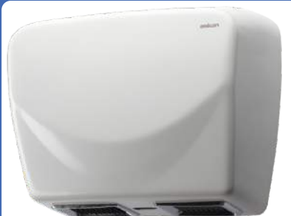
AS 25-IR (W) (Steel with white enamel coating)