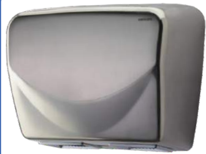
AS 25-IR SM (S.S. # 304 mirror finish)