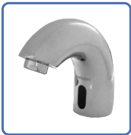
ASF-06E / ASF-06B